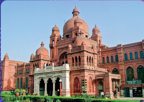
LAHORE MUSEUM - FASCINATING DISPLAY OF PAKISTAN'S HERITAGE