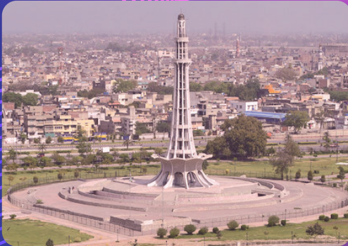
MINAR-E-PAKISTAN - SYMBOL OF PAKISTAN'S INDEPENDENCE MOVEMENT