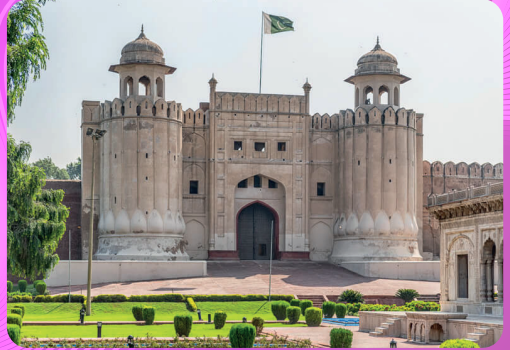
LAHORE FORT & SHAHI QILA UNESCO WORLD HERITAGE SITE