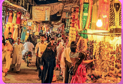
ANARKALI BAZAAR & LIBERTY MARKET BUSTLING SHOPPING DISTRICTS