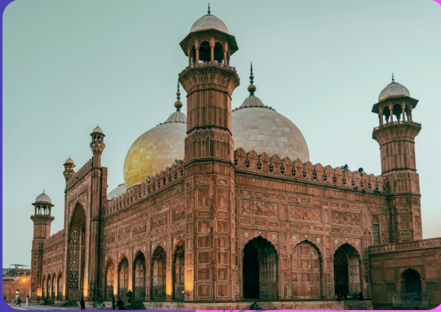
BADSHAHI MOSQUE A MUGHAL ARCHITECTURAL MARVEL