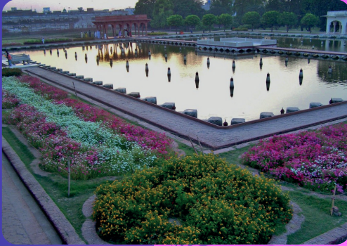
SHALIMAR GARDENS ROYAL GARDENS FROM THE MUGHAL ERA